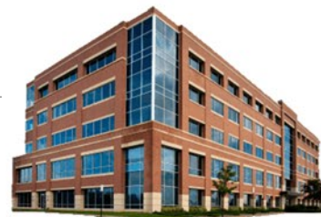
Preferred Payment Processor